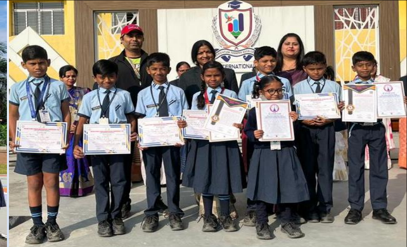
Interschool skating championship