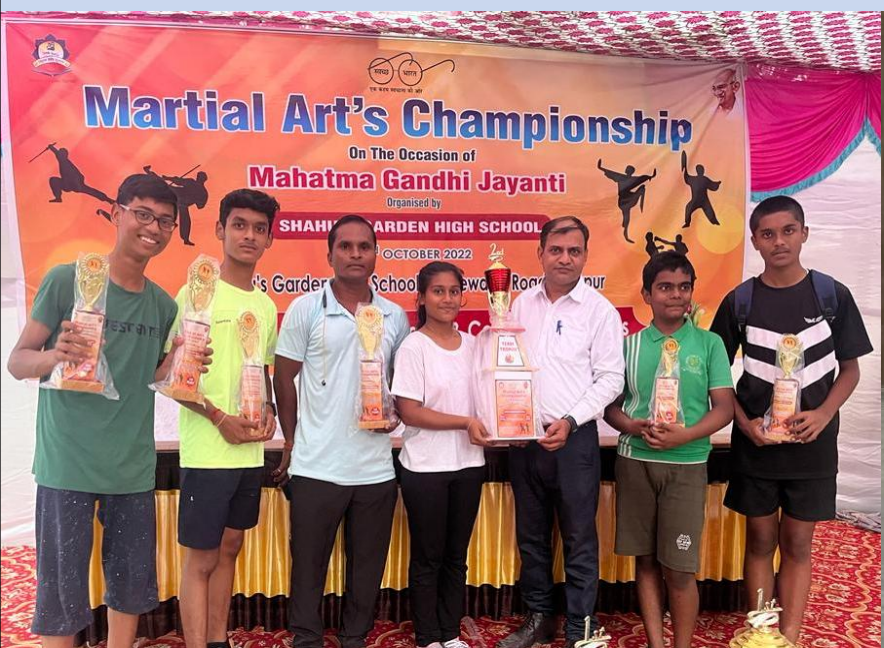
Inter district sub junior and junior Martial art championship