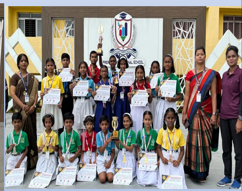
Nagpur District Yoga championship