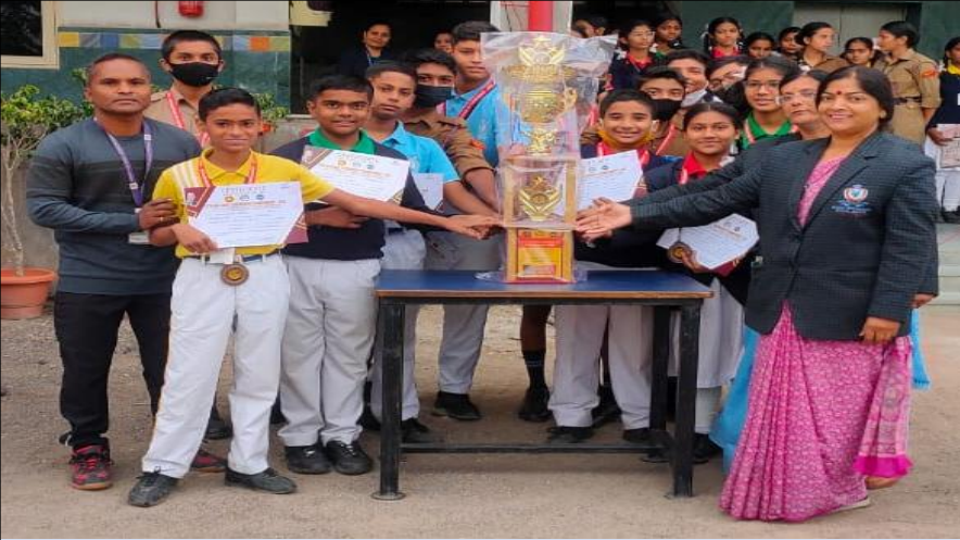
37th National ITF taekwondo championship