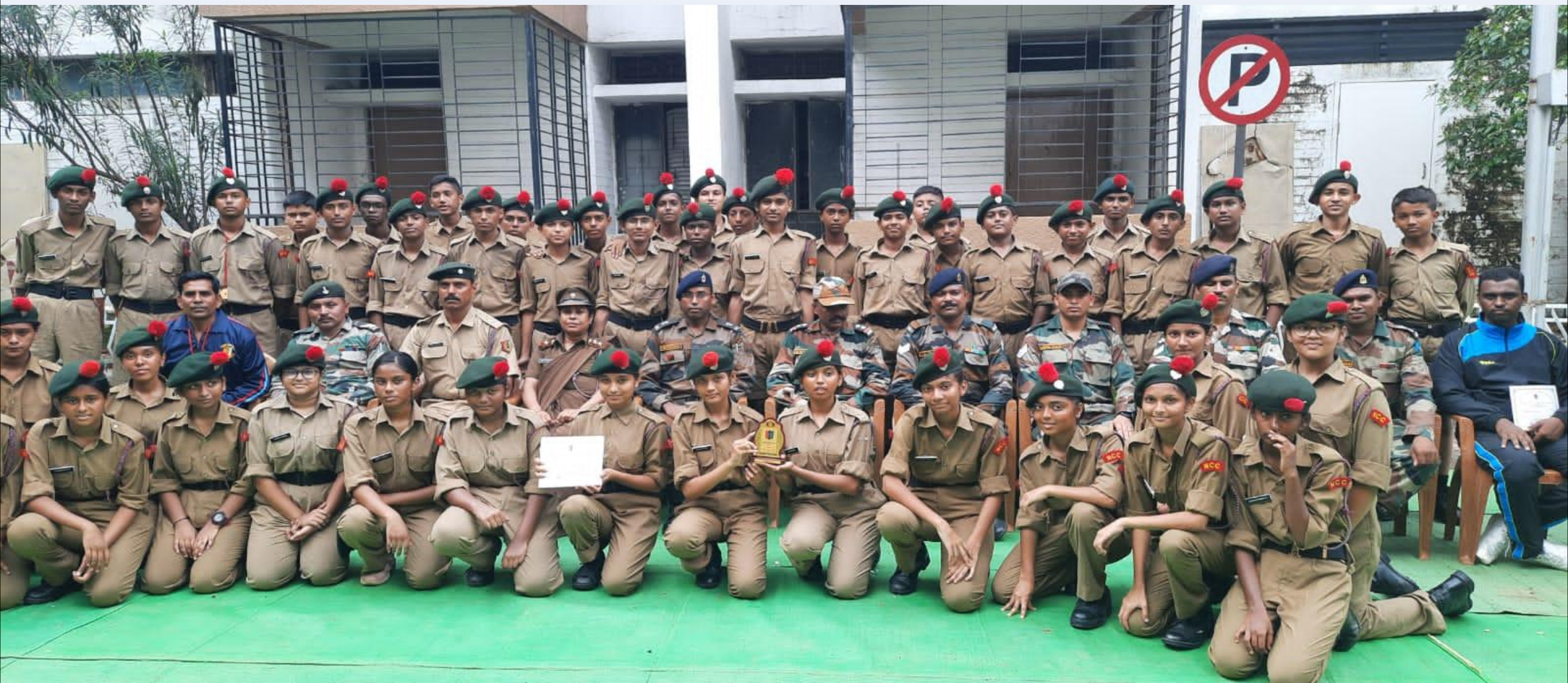
First Batch of PIS NCC- A certificate Exam