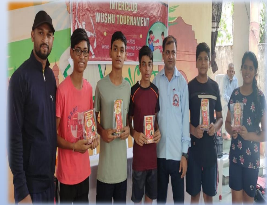
Interschool Nagpur district Wushu championship