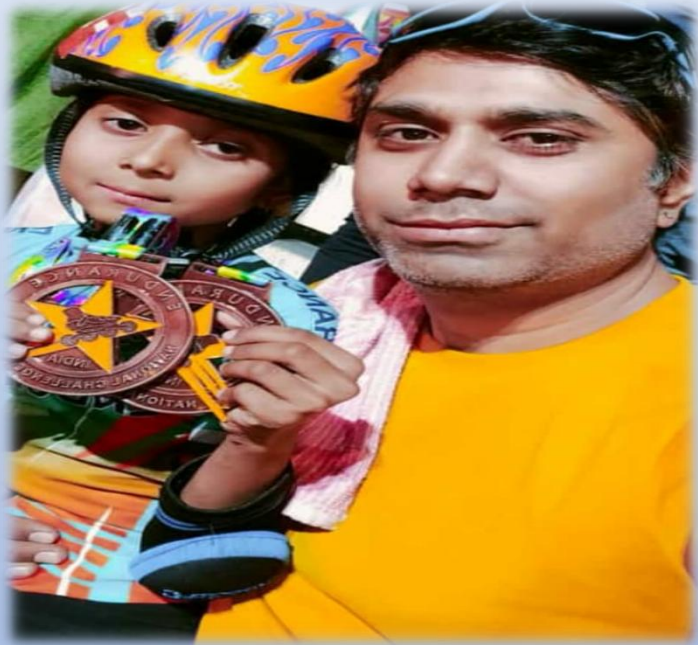
Open invitational roller skating road championship