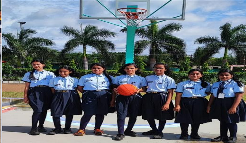
Interschool basketball championship