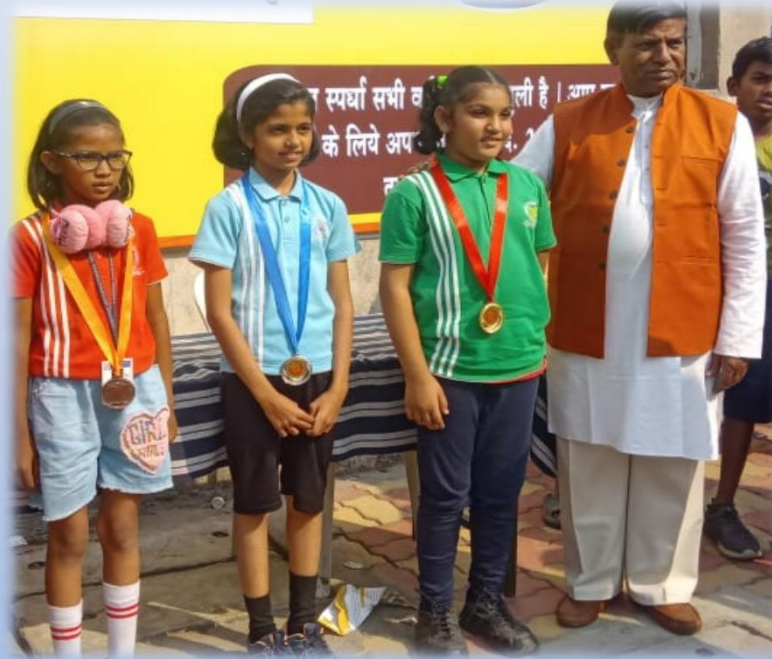
Open invitational roller skating road championship