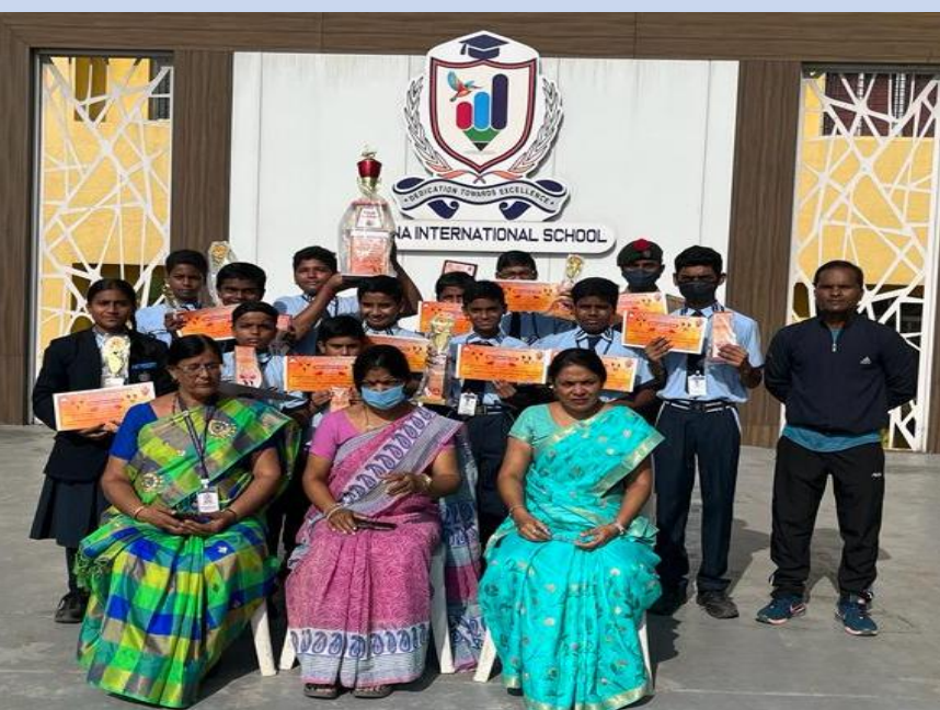
Interdistrict sub junior Wushu championship